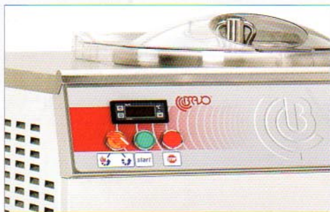
Inclined front panel with anti-drip upper edge.