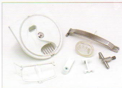
Removable door components for perfect cleaning.